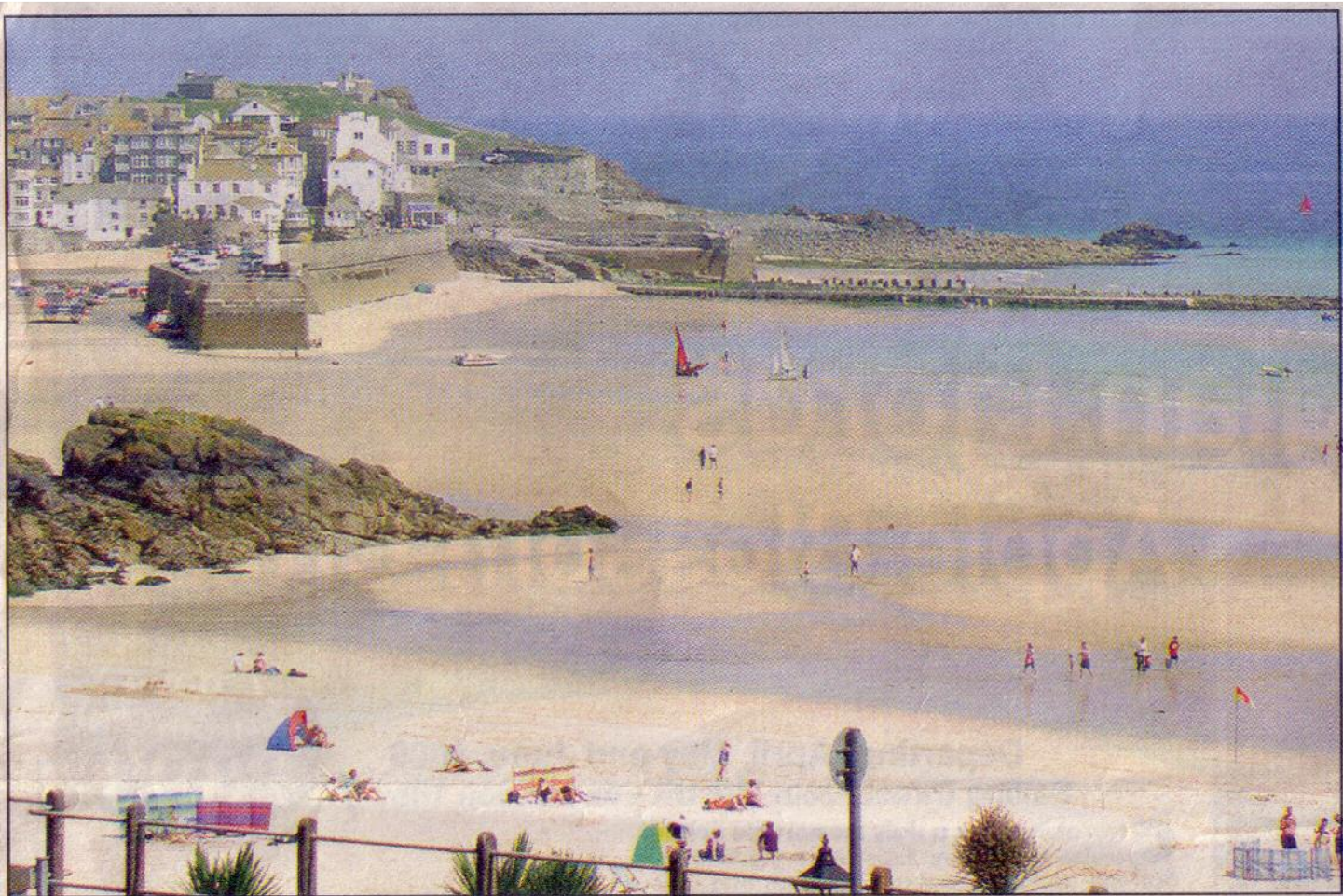
SEA VIEW? TRY THIS: What you see out of the windows at the Primrose Valley Hotel