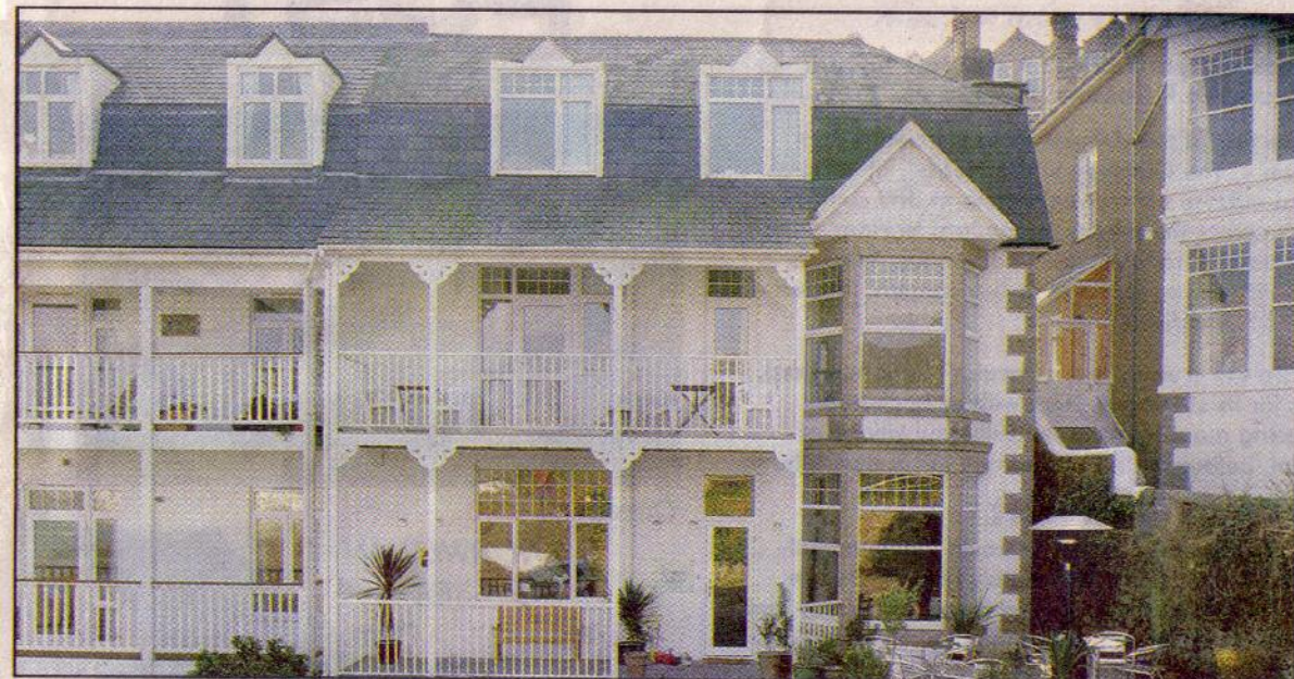
CORNISH STYLE: Primrose Valley's white-washed walls

dome-shaped conservatories that, in the four years since they opened, have become one of Britain's most popular tourist attractions.