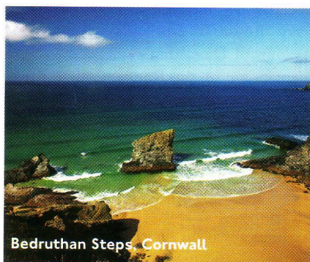
Bedruthan Steps, Cornwall

With bracing coastal walks in winter and sunny days in summer, every time of year has something to offer but most people visit between June and September. Be warned though, it can get crowded.